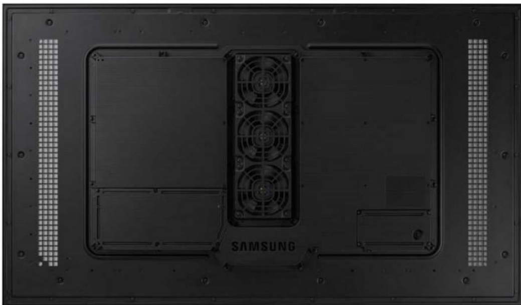
BACK (WITHOUT WALL MOUNT)